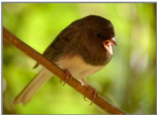
Dark-eyed Juncos topped the list of birds caught in Mist Net 4.