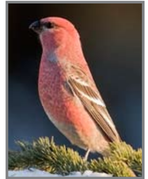
Pine Grosbeak

This year is the 110 th count for the continent, and the 49 th count for Fairbanks. Next year will be a landmark count for us. We would love to have your ideas for celebrating 50 years of Christmas Bird Counts in Fairbanks. Our count has certainly grown over the years, yet some of the same people who gathered for the first count are still counting. It is amazing that Fairbank's birders' sharp eyes have found 68 different species alive in the "dead of winter" over the course of 49 counts. We welcome you to join them and discover the enjoyment from a day outside helping to build a database of information on bird population trends unmatched by any other wildlife census. See you there!