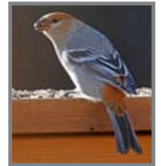
Female Grosbeak

Participate in scientific research from the comfort of your own home by joining the Fairbanks FeederCount. Bird populations are dynamic and we can learn a lot by simply tracking where birds are. Fairbanks FeederCount helps us document winter bird population trends in the Fairbanks area. To participate, just download instructions and a data sheet from the Alaska Bird Observatory's website at www.alaskabird.org . Click on the Citizen Science link on the side of page and scroll down to Fairbanks FeederCount. Then count the birds visiting your bird feeder on the three count days. This year's counts will take place on November 13 th , December 12 th , & March 6 th .