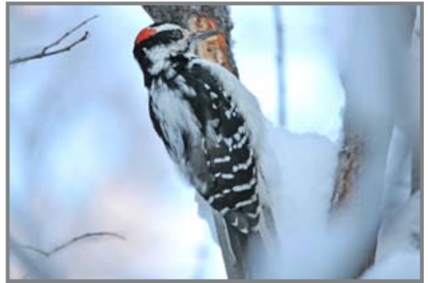
A Downy Woodpecker was spotted in University West.

All the information from the GBBC and other surveys goes into a massive bird database called the Avian Knowledge Network online at www.avianknowledge.net . AKN now holds 36 million records of bird observations which are used by scientists around the world.