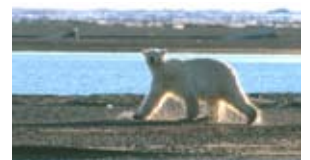
Polar bear in the Arctic Refuge