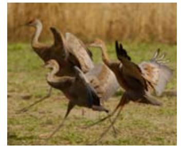
Sandhill Cranes land at Creamer's Field.