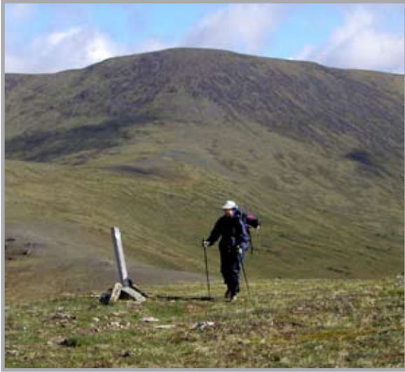
One of the photos in the new "Fairbanks Area Hiking and Birding Map" is of Mary Teel hiking the Pinnell Mountain Trail near Eagle Summit.