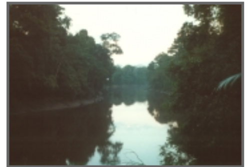
Rio Quebrada in Pacaya-Samiria National Park, Peru