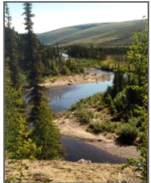
Killolitna River in Kanuti Wildlife Refuge